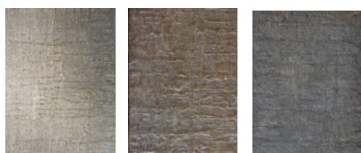
Faux Bronze powder grey