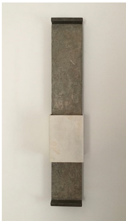
Ultra Slim Nuit de Chine